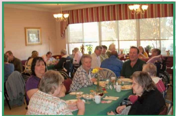
Residents and their families enjoyed the Family Holiday Dinner on November 11th. A freshly-cooked Thanksgiving meal was served.